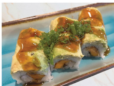
Sweet Potato Roll

Grilled Collar of Yellowtail Fish with Ponzu Sauce (Ask Server For Availability)