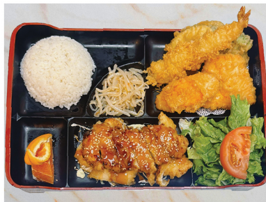
Dinner Combo Sesame Chicken & Tempura