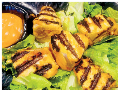
BBQ Albacore Tuna