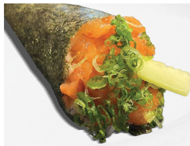
Spicy Salmon Hand Roll