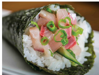
Negihama Hand Roll