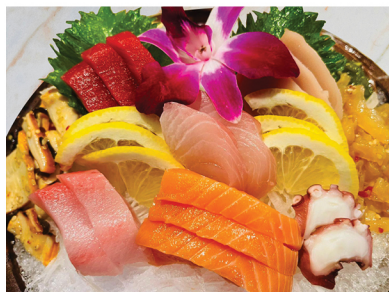
Sashimi Combo Small