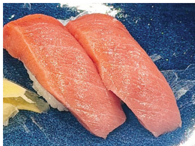
Maguro (Tuna) Nigiri