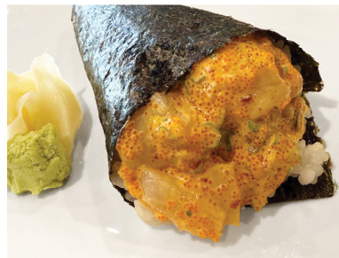
Spicy Scallop Hand Roll