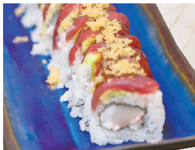
Super Bowl Roll