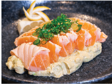
Garlic Salmon Lover