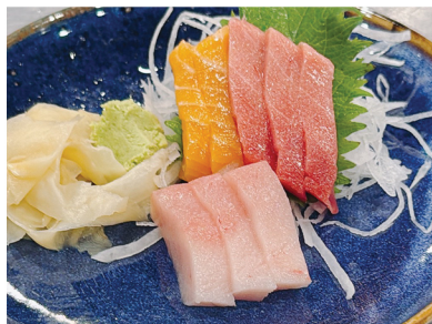
Sashimi 8 Pc