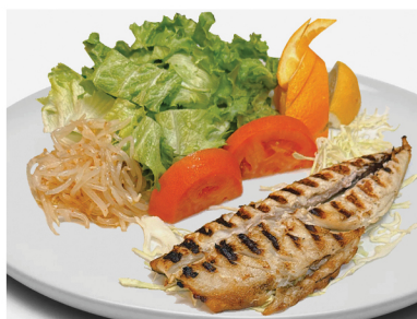
Saba (Shioyaki Style)