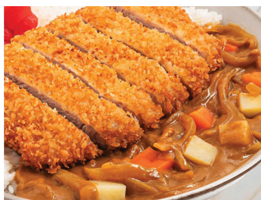
Chicken Katsu Curry