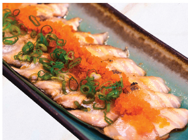
Red & White